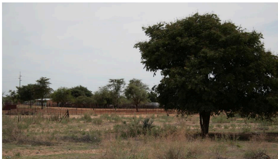
Figure 4: Vegetation in the western part of the Omusati Region comprises scattered trees and cultivated fields for small-scale crop production such as around this homestead. Pastures are mostly overgrazed, as shown by the low presence of grass after recent rains, and the predominance of the unpalatable shrub bitter bush ( Pechuel-Loeschian ).

The invasive poisonous plant is known as Madagascar rubber vine ( Cryptostegia Grandiflora ) is present at numerous places in the Omusati side of the landscape and should be controlled before it becomes a severe agricultural pest.