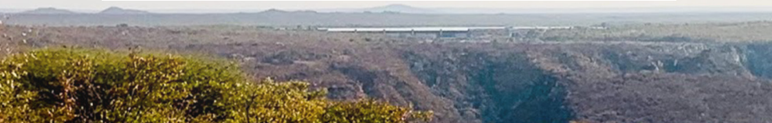
Table 1: Trend in land cover class/type change