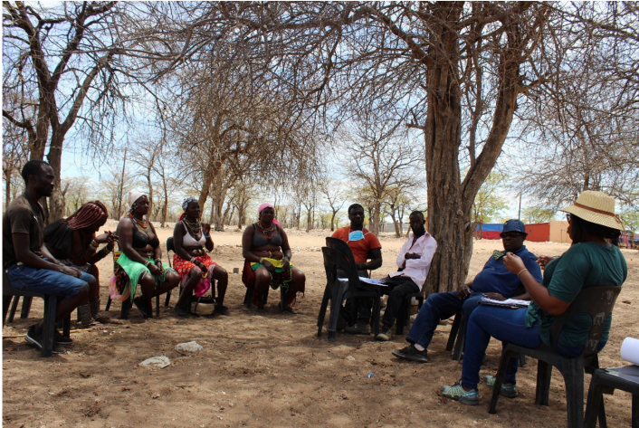
Fig. 1: showing stakeholder engagement between NDT and the Etoto Farmers Association committee members