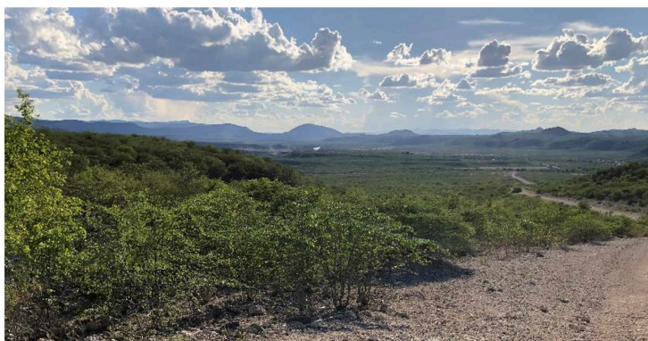
Figure. 3: Mopane scrub vegetation along the D3700 road west of Ruacana. The Kunene River can be seen in the far distance. The mopane scrub vegetation is typical of the western highlands in the Ruacana Focal Landscape.

The western part of the Landscape is covered mostly in mopane scrub which dominates in the vegetation type known as ‘western highlands’ (Mendelsohn, et al., 2002). The shallow soils prohibit the growth of large trees so the mopanes are fairly short (less than 3m high) and scrubby (Figure 1 4). This area falls in the Agro-Ecological Zones known as ‘Kaokoland mountains and hills’ and ‘Kaokoland high plateau’ (Bhalla & Rothauge, 2019), and is mostly used for livestock production. Small areas close to the Kunene River are used for small-scale crop production.