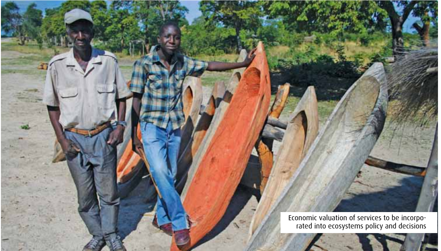
Economic valuation of services to be incorporated into ecosystems policy and decisions