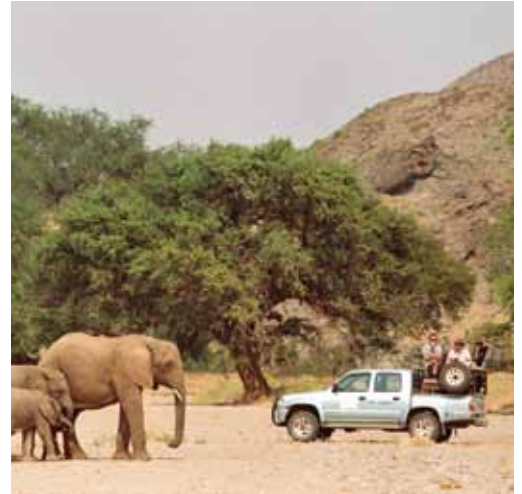
Cultural ecosystem services – wildlife viewing