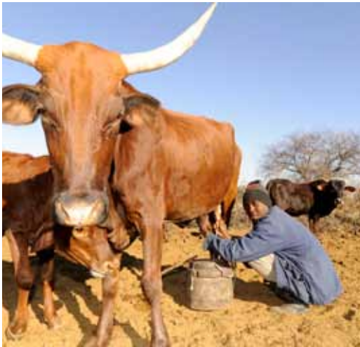
Provisioning ecosystem services – provision of dairy products

Ecosystem services are identified and categorised at the level of each individual ecosystem zone.