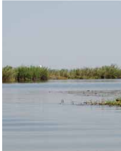
Regulation and maintenance ecosystem services – maintenance of chemical condition of freshwater