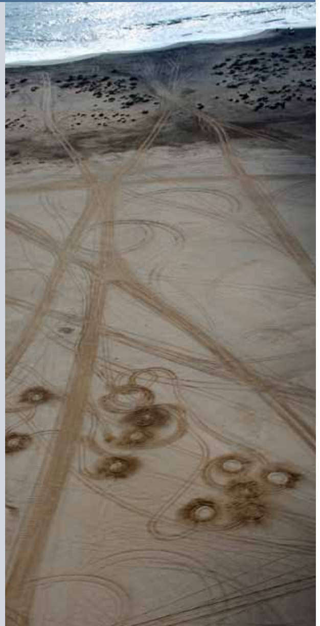
Habitat change has negatively impacted the terrestrial ecosystem zones

The flow of cultural services relating to physical interactions has increased significantly over the past 50 years, primarily as a result of increased tourism and recreation ( exploitation ). This trend is expected to continue into the future. The effects of habitat change, pollution and illegal use (e.g. poaching) on these services are unclear. They generally represent negative pressures but they are not necessarily significant enough to affect the delivery of the service. Services relating to spiritual, symbolic and intellectual interactions are generally not well understood, and the effects of the different pressures are unknown.